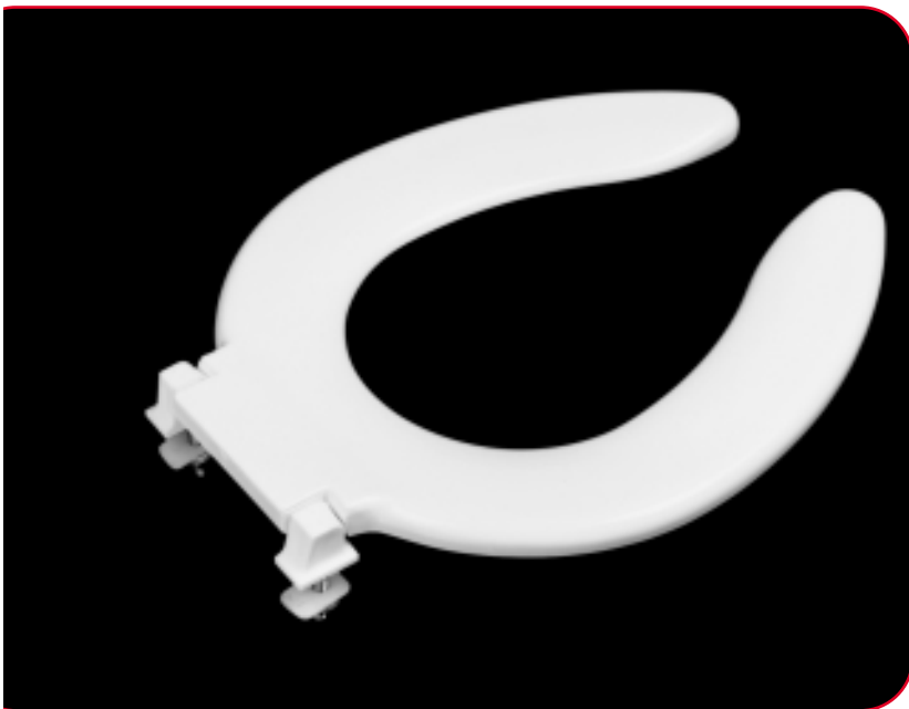
523 Elongated (Open front seat less cover)

For special orders requiring antimicrobial and flame retardant features, please contact our Customer Service Department for details and minimum order requirements.