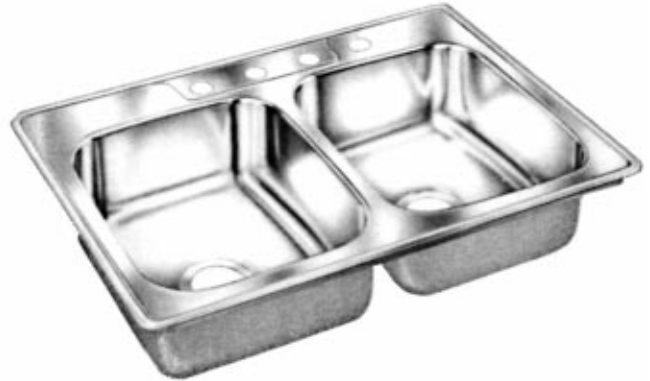
Model D-23322-4 Shown