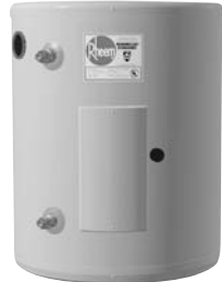
6, 10, 15, 20 and 30 Gallon

Available in 2-1/2, 6, 10, 15, 20 and 30 Gallon Models