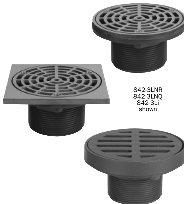
842-3LNR 842-3LNQ 842-3Li shown